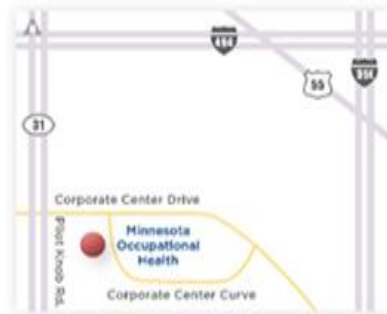
EAGAN LOCATION | 1400 Corporate Center Curve Suite 200 Eagan, MN 55121