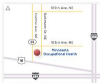
BLAINE LOCATION | 10230 Baltimore St. #300 Blaine, MN 55449