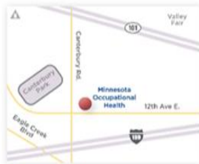
SHAKOPEE LOCATION | 4360 12th Ave. E. Shakopee, MN 55379

Monday – Friday 7:30 a.m. – 4 p.m. (651) 968-5300